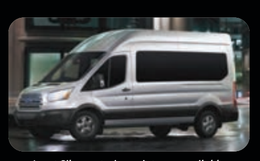
Ingot Silver exterior paint now available