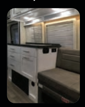
High Gloss White cabinetry

This versatile Class B motorhome is designed for today's active lifestyles. Experience unrivaled fuel economy combined with legendary Ford® styling and reliability. Relax in luxurious captains seats while enjoying the view through large frameless windows. The interior ergonomics ensure you are as comfortable on the road as you are at home. Beyond gets you where the action is, in style!