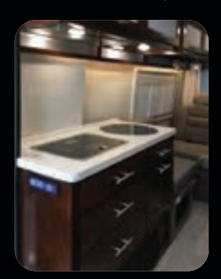
High Gloss Cherry cabinetry